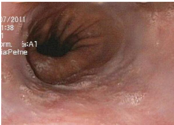
Photo 3. Endoscopic image after RFA treatment