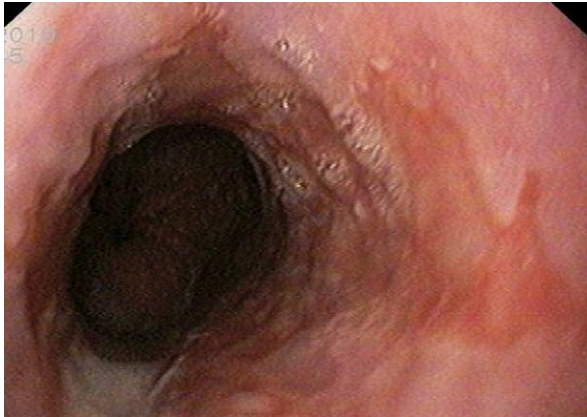
Photo 1. Barrett's esophagus; metaplastic epithelium focal areas visible in the lower part of the esophagus